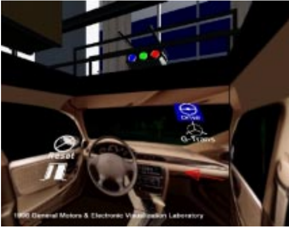
Figure 4. VisualEyes, a distributed design review system from General Motors. The design of a car interior is projected on the walls of the CAVE. Remote participants are able to enter the space and see and critique the design from various points of views and make minor adjustments.

database, simulation, haptics, rendering), each with distinctive requirements in terms of both performance and the mechanisms that can be used to implement the flows [18]. For example, tracking information need not be propagated reliably but can almost always benefit from multicast, while database updates require reliable communication but cannot always use multicast capabilities.